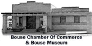
Bouse Chamber Of Commerce & Bouse Museum