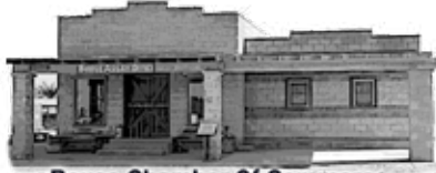
Bouse Chamber Of Commerce & Bouse Museum

Our work crews have covered a lot of ground this season and only one more crew is needed to wrap up the Museum fence, then we're taking the summer off!